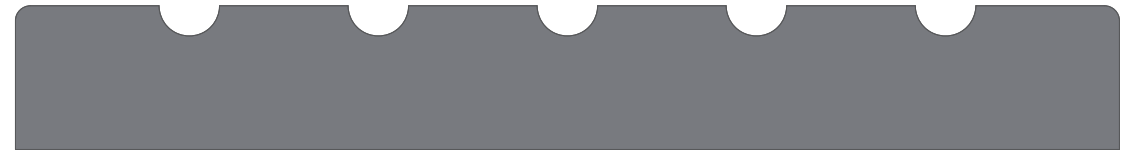
DETAIL _ SECTION